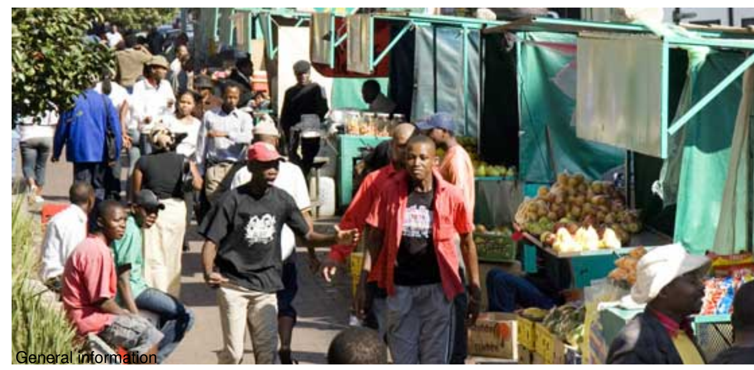
More information on getting a trade licence in Johannesburg, including the procedure and cost involved. Click here [PDF: 22kb

CERTAIN businesses need a licence to operate. Before opening any business find out what the requirements are. You may not begin trading in a business that requires a licence before the licences has been issued. Trading without a valid licence is punishable with a fine of up to R2 000. Licensing is governed by the Business Act No 71 of 1991.